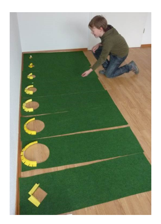
Figure A2: The marble lanes